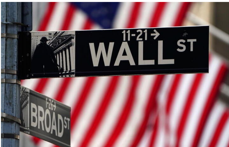
A Wall Street sign is pictured outside the New York Stock Exchange in the Manhattan borough of New York City, New York, U.S., April 16, 2021.