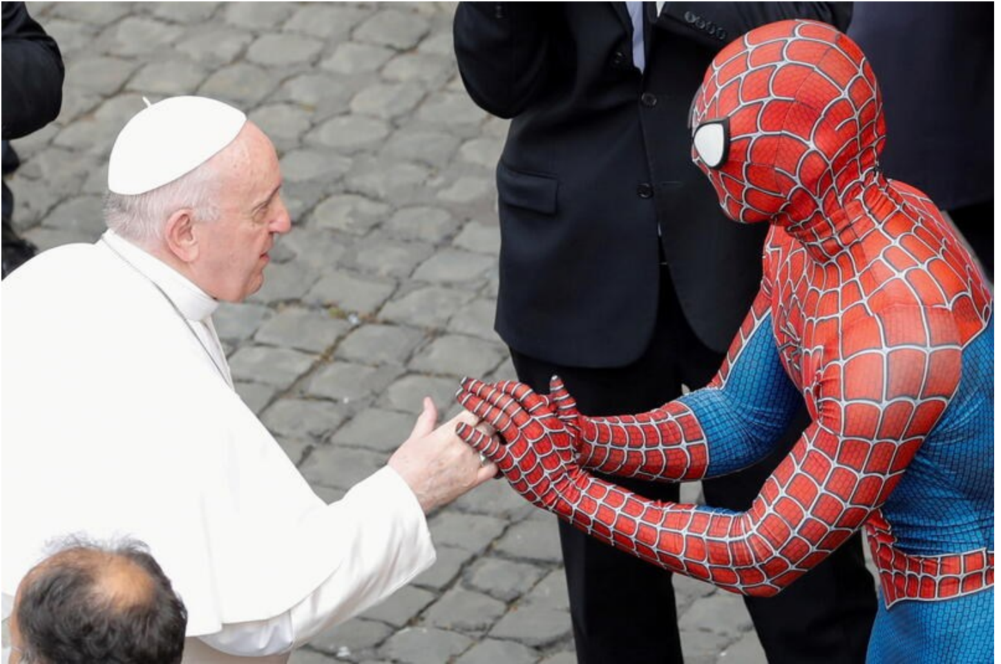
Pope Francis greets a person dressed as Spider-Man after the general audience, amid the coronavirus disease (COVID-19) pandemic, at the Vatican, June 23.