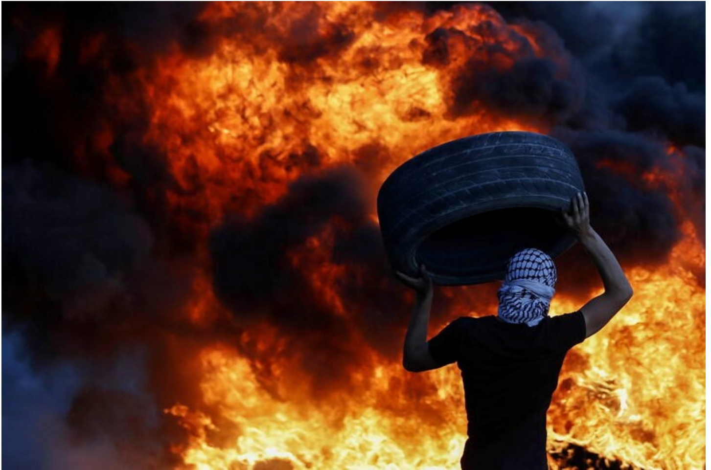
A Palestinian demonstrator carries a tire amid preparations for a night protest against Israeli settlements in Beita in the Israeli-occupied West Bank, June 22.

The Financial and Risk business of Thomson Reuters is now Refinitiv.